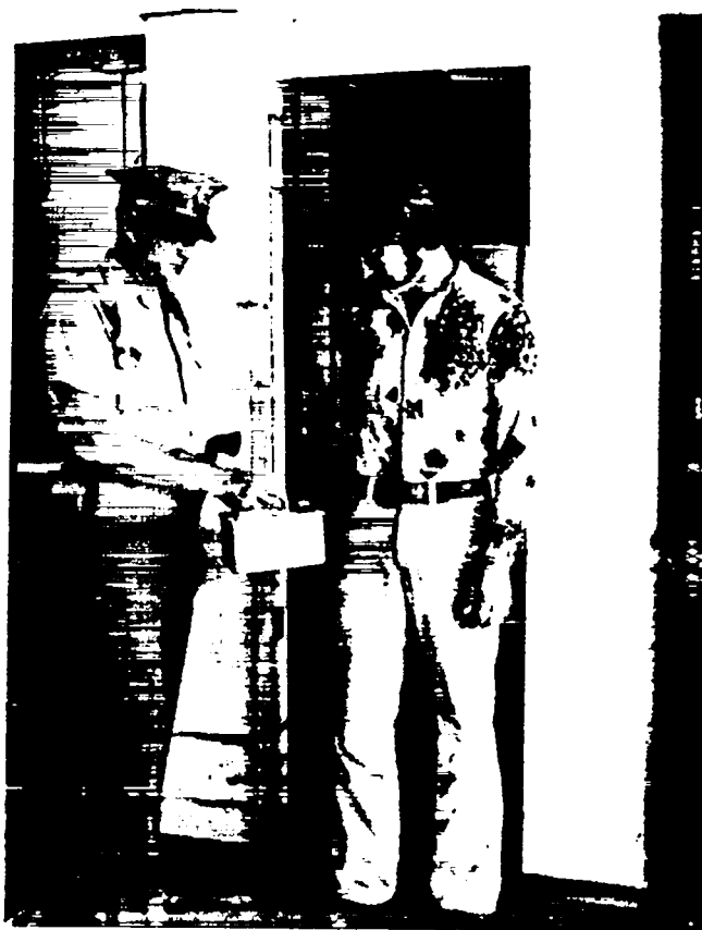
Search of a person with the portable monitor after the doorway monitor in the background has produced an alarm.